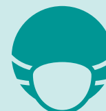
Personal Protective Equipment (PPE)