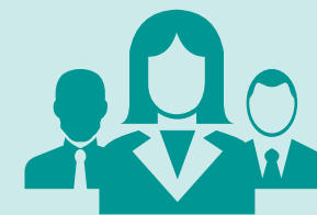
Service Provision Issues