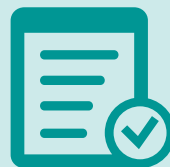
Planning (including complex support and/or communication needs)