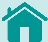
Home (including homelessness, rent eviction)